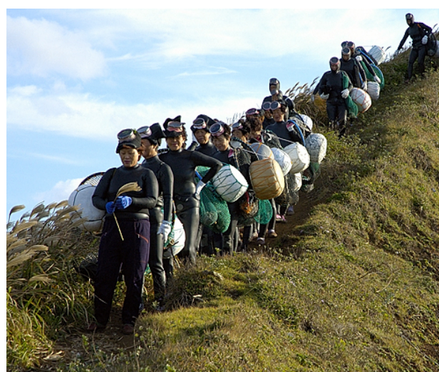
Contemporary Jeju women divers

Although Jeju Islanders' early efforts at resisting Japanese incursions into their fishing areas failed and they moved on to adapting to the new political situation, more bursts of resistance against Japanese rule followed in the 1930s (Yang 1996). Jeju's women divers played a key role in some of these movements (Fujinaga 1989). By then they had fishing rights to the whole Korean peninsula and were used to organizing themselves economically, so although they had no formal schooling, it was a small step for them to form groups to actively agitate for change in areas where their rights were abused.