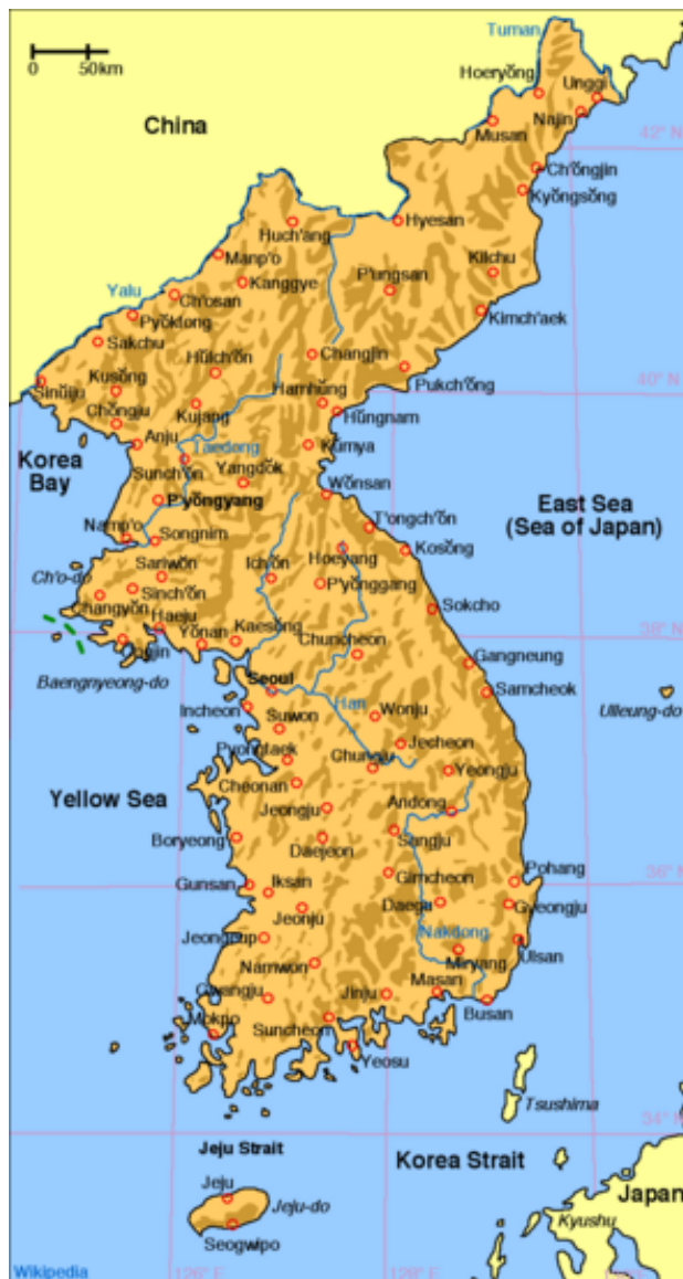
Map of the Korean Peninsula