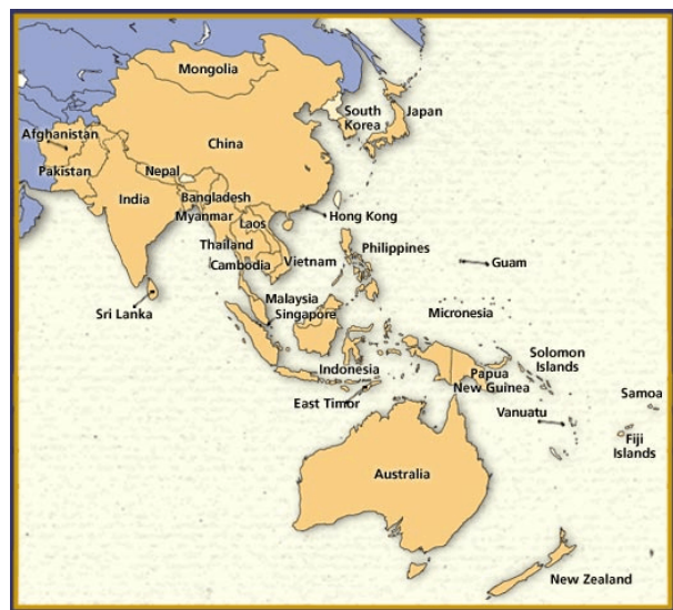
Map of the Western Pacific

Despite centuries of subjugation by larger neighbours—Joseon Korea, Imperial Japan, and South Korea—Jeju island society has maintained a distinct identity and a measure of autonomy. Relations with both Korea and Japan have at times had devastating effects on the islanders, but also contributed to the dynamism of Jeju island society and opened up new routes for islanders to continue traveling as a vital part of their social life.