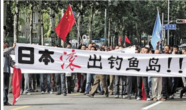
Chinese demonstrators on September 18, 2010 at the Japanese Embassy in Beijing

In this fashion, the Bao-Diao Movement in the Chinese sphere has risen and fallen, to rise again, in response to developments of recent history. One wonders how clearly the ruling Democratic Party of Japan understands this background and prevailing conditions.