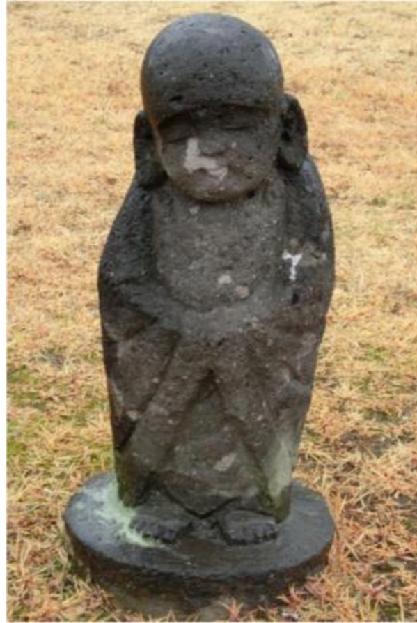
A Stone Buddha on the reclaimed land in Minamata.