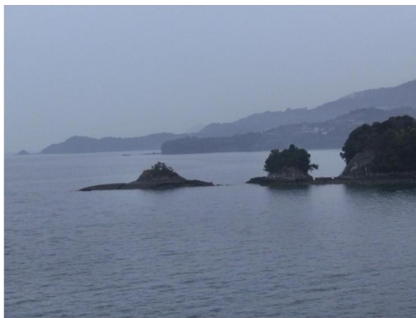
Minamata Bay in winter.