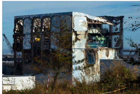
Fukushima Daiichi Reactor No.4, May 2012.

Experts fear that a catastrophe on an even larger scale could still occur. Koide Hiroaki, a nuclear scientist at Kyoto University, warns that Japan ‘will be finished’ if approximately 300 tons of spent nuclear fuel (4,000 times the size of the Hiroshima atomic bomb) kept at the spent-fuel pool in the badly damaged No. 4 reactor building, release radiation as a result of a cooling failure caused by, for instance, another earthquake. 11 If this happens, the entire Fukushima nuclear complex will become inaccessible, leading to radioactive emissions on a cataclysmic scale, perhaps 85 times as great as Chernobyl. 12 TEPCO reported previously that as of March 2010 there were 1,760 and 1,060 tons of uranium at Fukushima Daiichi and Daini, respectively. 13 A simple calculation, based on Koide’s estimate above, suggests that this is equivalent to 28,000 Hiroshima bombs. A ‘chain reaction’ involving all six reactors and seven spent fuel pools at the complex was envisioned as the ‘worst case scenario’ by Kondo Shunsuke, Chairman of the Japan Atomic Energy Commission, in his report submitted to the government two weeks after March 11. The report, which was suppressed by the government, concludes that if the ‘chain reaction’ happens, the exclusion zone may have to be greater than 170km. 14 Tokyo is 220km away from the plant. Kondo’s report thus is largely consistent with Koide’s prediction, although they hold opposite positions on the question of nuclear power generation.