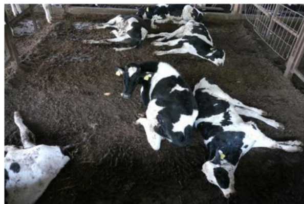
Starving cows in Fukushima

When I considered Chisso as offender, I thought that I had nothing to do with it. I thought that it was just a company, with power in the system. But when I began to perceive myself as 'another Chisso', I experienced a sense of crisis that I myself was moving away from the connectedness of life. 63