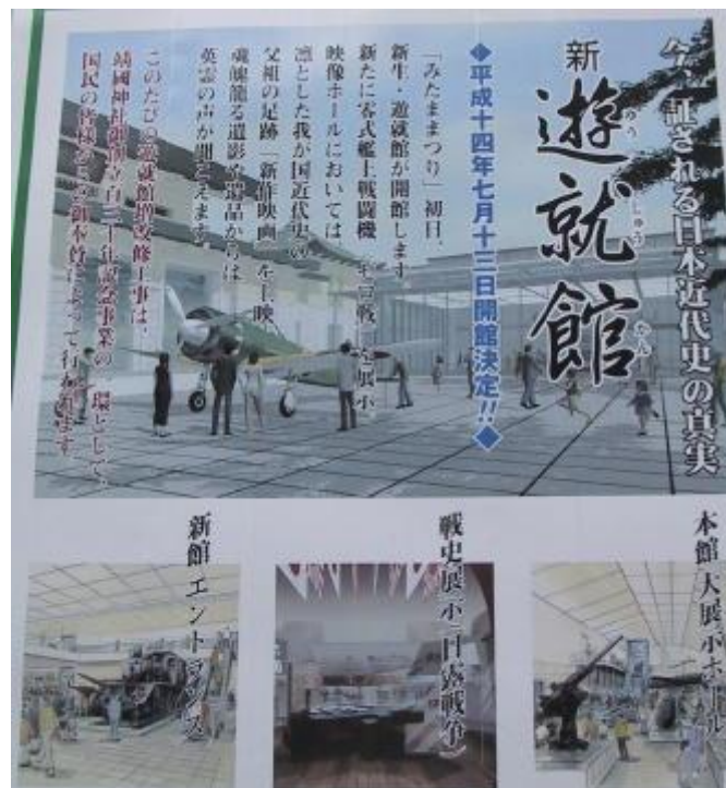
Yushukan war history exhibits at Yasukuni Shrine

While most revisionist accounts are available only in Japanese, some have also appeared in English since the 1990s. As the history and memory of the NM became internationalized, the Japanese revisionists have attempted to convince the world that what is known as the NM has been falsified. The spirit of these revisionist versions has much in common with some equally emotional, nationalistic, and ethnocentric statements about Nanjing that have emanated from China and the United States. Indeed, each has fed off the others. In China, many accounts and museum exhibits dealing with Nanjing have fostered a self-congratulatory nationalism, calculated to strengthen loyalty to the government while paying scant attention to the facts, as opposed to reiterating an iconic position such as the 300,000 deaths. The same may be said, from across the ideological barricades, of the Yasukuni Shrine's museum presentation of the Pacific War with its complete lack of reference to Japanese atrocities. Moreover, some American works on Nanjing have ascribed the atrocities to an alleged Japanese racial character or unique cultural behavior, ignoring the widely shared racist thought that lay behind the war's savagery. [7]