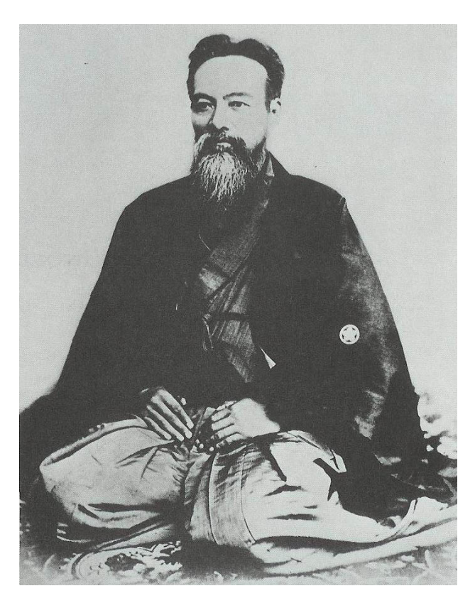
Yamaoka Tesshu, founder of the Shumpukan School of swordsmanship.

Ichiko was not exactly an exception. Yamaoka Tesshu looked into the past when he established his Shumpukan School of swordsmanship in 1880. There, beginning students went through 1,000 consecutive days of practice, an idea straight from Miyamoto Musashi's Book of Five Rings, and ended it with a final exam of 200 consecutive contests, all held within a 24-hour period. (The highest level examination consisted of 600 matches in three consecutive days.) This regimen was designed to achieve a state of "selflessness," which Tesshu defined as the "essence of Bushido." [ii]