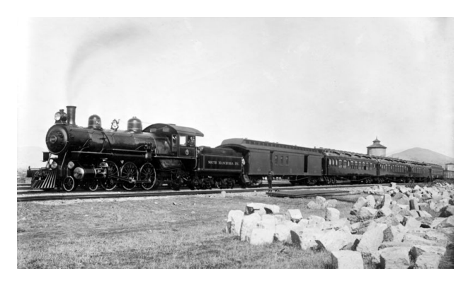
South Manchurian Railroad . . . symbol of Japanese power and industrialization