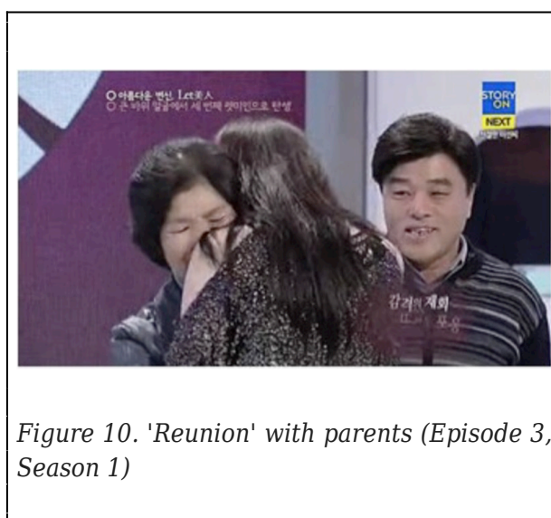
Figure 10. 'Reunion' with parents (Episode 3, Season 1)

parents have a responsibility to deal with much as they invest in their children's education. The narrative of Let Me In emphasises this filial dimension through scenes in which parents repeatedly thank their children for their hard work (' kosaeng-i manatta '), effectively reaffirming the process of cosmetic rebirth as an action that embodies filial piety through acknowledging their children's willingness to submit to physical pain as an act that erases the physical evidence of the parents' inability to ensure their children's future success. 25