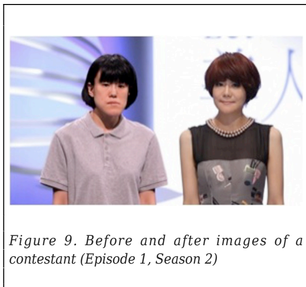
Figure 9. Before and after images of a contestant (Episode 1, Season 2)

Finally, the contestant is tearfully reunited with her parents (or occasionally a sister), and in this scene we can see how the moralizing discourse of the process of the pyönsin takes its full effect (Fig. 10). The time away from parents is presented as both a sobering experience for the young contestant, and a moment of joy (and occasional bewilderment) to the parents who are shown as visibly proud of their children's courage to withstand the pain associated with the period of recovery. This is intriguing, as the surgery here is presented not only as a physical improvement, but a way to restore harmony within the parent/child relationship through somatic 'rebirth'. The previously offensive appearance (caused by lack of fortune) is projected as not only visually displeasing but also a photographic reminder of the contestants' moral deficiency, whereas the process of pyönsin comes to signify respect toward one's parents, gained through hard work and pain, all of which are evidenced in the - often quite spectacular - after image of the pyönsin . 24 The parents' approval and delight at the outcome of the surgery emphasises a much wider, socially accepted idea that a non-standard appearance (as defined above) is a serious disadvantage in increasingly competitive society and one that