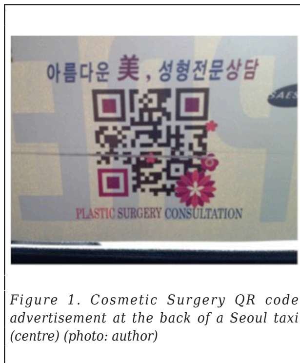
Figure 1. Cosmetic Surgery QR code advertisement at the back of a Seoul taxi (centre)

You only have to spend a day in Seoul to realize that appearances do matter in contemporary South Korean society. Advertisements for various cosmetic surgeries are conspicuous everywhere—from taxis ( fig. 1 ) to public transport and underground stations ( figs. 2 and 3 ), all evidence that the industry is booming.