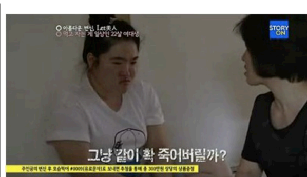
Figure 5 “Why don’t we just die together?” (A still from Episode 3, Season 1)

in modern society and the implied imperative for parents to ensure that their children can choose to do so certainly suggests an additional dimension to somatic subjectivities within the popular narratives of cosmetic surgery practices in Korea to those seen in the Western version of the genre where such suggestions of parental guilt are much less of an issue.