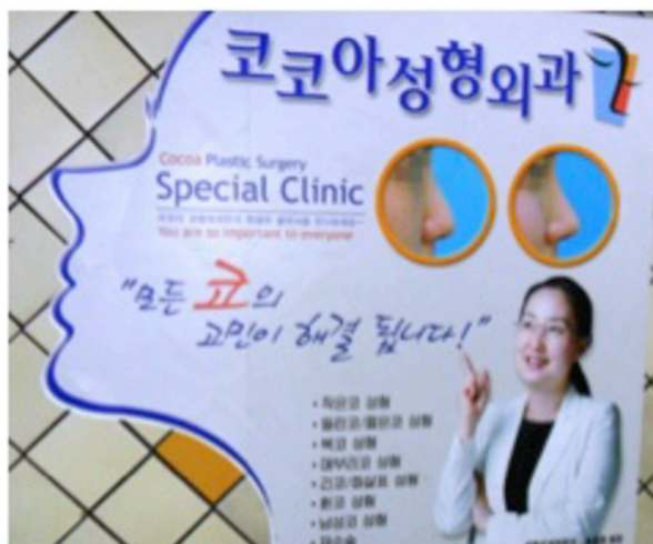
Figure 3. Advertisement at a Seoul underground station, with before and after images of rhinoplasty

associated risks in popular discourses about cosmetic surgery in South Korea and focuses on the possibilities that it portends.