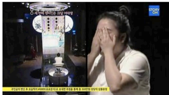
Figure 6. The backstage opens to a brightly lit back studio (Episode 3, Season 1)

separating the two studios is literally torn asunder and the successful contestant is physically 'let in' (in an intentional reference to the title of the programme) as she physically moves into the brightly lit back studio where the delighted studio audience and the panel of professionals are waiting to begin the business of grafting the body of the contestant into something more acceptable. The visual vocabulary in these scenes (in particular in Season 1), which draws the viewer to make a symbolic connection to Roman Catholic iconography on the last judgement, purgatory and heaven, 22 clearly emphasises the power invested in medical intervention: the contestant is literally transported from the purgatory of pre-operative self to the biomedical technology heaven of surgical knowledge and expertise (Fig. 6).