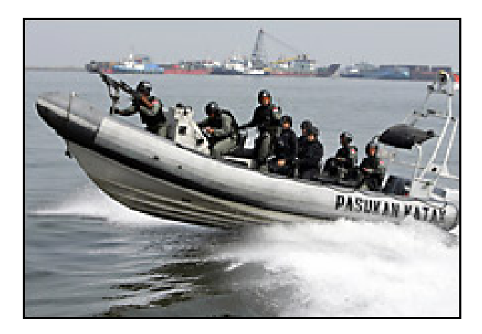
The navies of Singapore and Indonesia hold a joint exercise in August 2006

Since 9-11, many steps have been taken to improve security in the Straits. These include the MALSINDO coordinated patrol by the navies of the littoral states, the 'Eye in the Sky' air surveillance over the Straits, the creation of the Malaysian Maritime Enforcement Agency (MMEA), and increased patrols conducted by the littoral states.