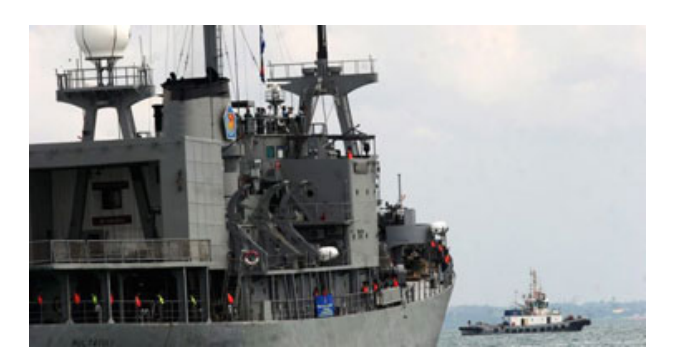
An Indonesian navy ship patrols the Straits

safety in the Straits, Indonesia has called for international burden sharing as provided for by the Article to be enhanced and expedited [4]. From its perspective, any discussion of the subject should include both the littoral and user states, and should never undermine the sovereignty of the latter.