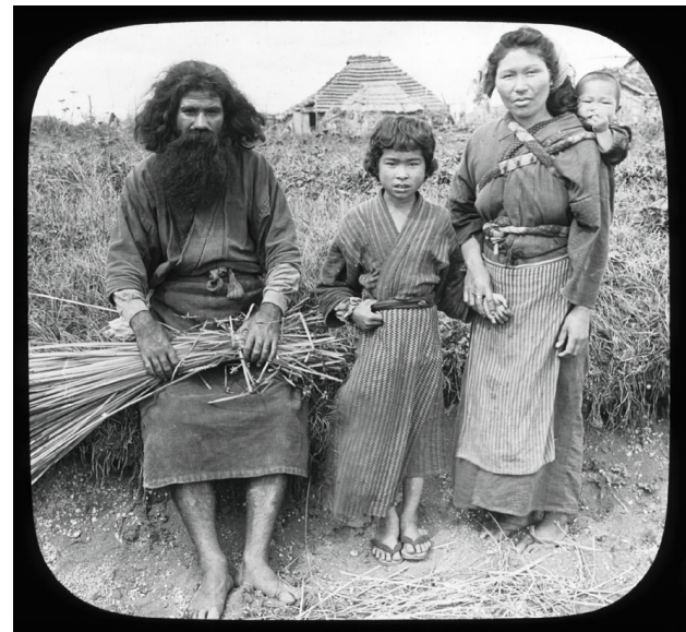
Ainu family, 1906

Seen in this way, we can understand that the discourse of “opening” operates as a universalistic expression of the ethnic enterprise and its progressiveness. A society like that of the AINU, possessing neither the form of the nation-state nor the structure of capitalism, is thus posited as an ethnicity which utterly lacks the ability to manage itself, to say nothing of the ability to “open” frontiers. It is the “undeveloped” or “childlike” remnant left behind by the historical law of “progress,” one whose only option is to survive through the leadership and patronage of a more “progressive” ethnicity. Consequently, historicism and ethnocentrism resolve themselves in reducing the rich historical experience of mankind to the binary structure of “progress or stagnation,” and each ethnicity is thereby rewritten into a narrative of its oscillating rise and fall.