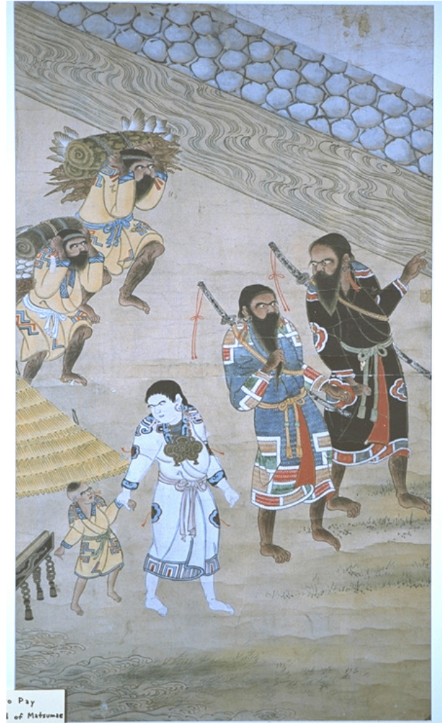
Ainu group in a Japanese representation in Edo

The formulation of a cultural hierarchy seen in this passage provided the logic that enabled the Japanese state to justify the necessity for its people to appropriate and rule the territory of Hokkaido in place of the Ainu by making the former the assumed subjective motor-force of this "opening," while rendering the latter into an ethnicity ( minzoku ) that had "not yet managed to escape a savage and uncivilized stage." Further, the new anthology of Hokkaido history compiled in 1937 insisted on the point that the "opening" made it possible for the Japanese to "enlighten the Ainu," who had "for a long time continued their primitive lifestyle," through the imperial assimilationist educational policy ( kominka kyoiku ) and it brought about a real possibility for the Ainu to "be granted universal brotherhood, and treated as national citizens." [3]