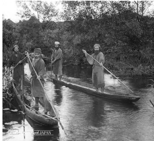
Ainu fishermen c. 1900

It is crucial to heed the fact that the expropriation of territory and their rights to life proceeded simultaneously and parallel to the process by which the Ainu, a term connoting a proud person or people, was transformed into the humiliating term “native” ( dojin ), a word indicating a savage or uncivilized people. Because, when we turn our attention to this historical fact, we can immediately understand that the operation of the representation of the subject (from human to “native”) and the material destruction and expropriation of non-capitalist society are two deeply imbricated strategies. Racism (one form of the representation of the subject) justifies the operation of reification in capitalism (in a Lukascian sense) as natural – social relations amongst human beings are formed through the mediation of things (the commodity), and thus humans themselves come to exist as things or commodities. The slave trade, in other words, the exemplary commodification of human beings, cannot be explained without an understanding of the justifications of racism or its operations of representation, nor can we understand the history of the expropriation of the Ainu without considering the relationship between racism and reification.