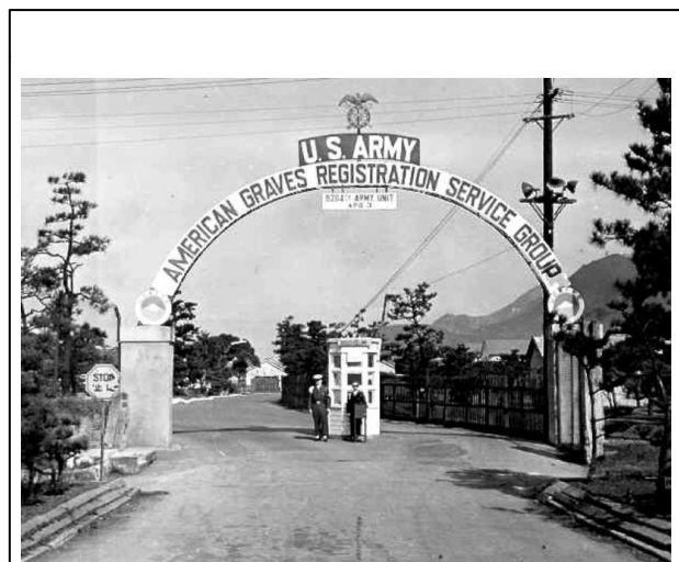
Camp Jono, Kokura, Japan