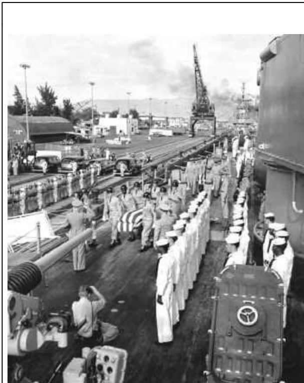
Unloading bones at Kokura

skeleton to be completed for each body. (The instructions on the diagram read, 'black out parts of body not received'). 27