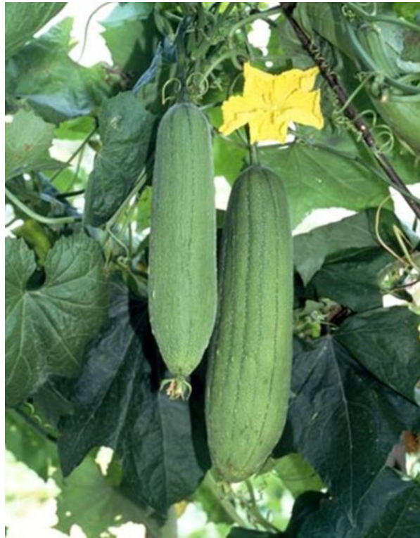
Sponge Cucumber Gourd

In a telling comment, Hino Keizō, one of the Akutagawa Prize committee judges, describes such passages as the story's final image of a dazzling hibiscus attached by a long vine to an enormous gourd as 'Okinawan' ( Okinawa teki ). 21 Kuroi Senji, another judge, similarly cites the spontaneous appearance of a crowd of villagers driven by curiosity to gather around Tokushō's home in hopes of learning more about his illness as the work's most striking feature. Such masses, Kuroi explains, have long been absent in Japanese fiction. 22 In Hino's comment, it is the oddity of "Droplets"—tropical flowers and vegetation redolent of the subtropics—that marks the work as 'Okinawan.' For Kuroi, presumably accustomed to stories of alienated city dwellers, the foreignness of crowd formation is what makes the work regional. Both judges' comments, patently orientalist in their dismissive categorization of difference, nevertheless elucidate Medoruma's knack for creating a vibrant place where, depending on