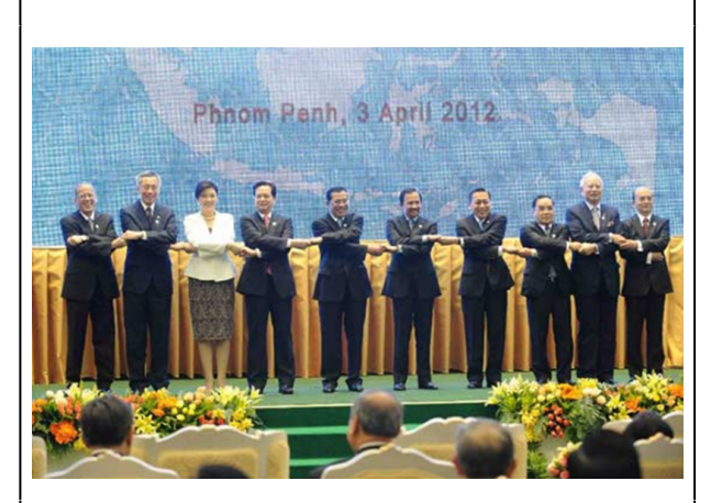
Leaders at the 20<sup>th</sup> ASEAN Summit in Phnom Penh, April 3, 2012

In October 2003, the summit meeting of the heads of government of the Association of Southeast Asian Nations (ASEAN) issued a major statement that declared, "[a]n ASEAN Community shall be established comprising three pillars, namely political and security cooperation, economic cooperation, and sociocultural cooperation..." Each successive ASEAN Summit and Annual Ministerial Meeting (AMM) of foreign ministers has advanced this goal. It was expected that the 45<sup>th</sup> AMM, held under the motto "ASEAN: One Community, One Destiny," would follow its predecessors by adopting further measures to make the ASEAN Community a reality. As events transpired, differences among ASEAN states over how to manage territorial disputes in the South China Sea emerged as a litmus test of their ability to achieve an ASEAN Political-Security Community by 2015.