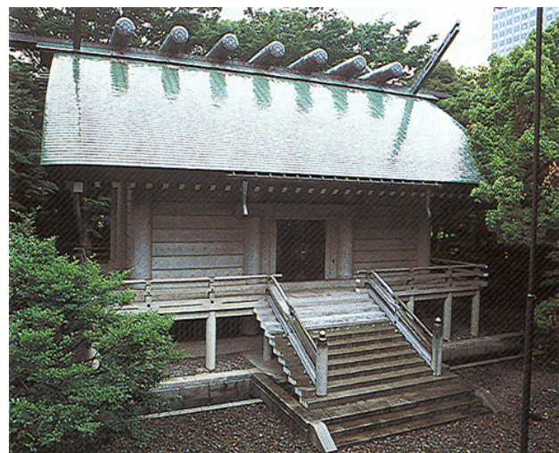
The Repository

main sanctuary at Yasukuni, there are files, presently being digitalized, containing personal details. The latest shrine figures for the dead are as follows: the Manchurian 'incident' 17,176, the China war 191,250, and the Pacific war 2,133,915. I say 'the latest figures' because those for the Pacific war change. Last year, the shrine enshrined 12 new kami. Families of the war dead inquired of the shrine whether their fathers, brothers or uncles were venerated at Yasukuni; the shrine carried out checks and discovered that these names were not in the archive. The dead were duly transformed into kami through a rite of apotheosis. [2]