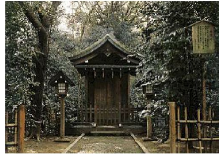
The Spirit Pacifying Shrine

Visitors to the Great spring and autumn rites are not encouraged to visit the Chinreisha or Spirit pacifying shrine. In fact, the vast majority of them are entirely ignorant of its presence. This is because the Chinreisha sits to the southern side of the Main sanctuary enclosed by a steel fence. The shrine was built in 1965 and the steel fence was erected a decade later. The reason for the construction of the fence, as explained to this author, was that the chief priest at Yasukuni had received intelligence that unknown persons were planning to blow the Chinreisha up. It is clear, however, that the very existence of the Chinreisha is a matter of great controversy within the Yasukuni priesthood. Why would anyone want to blow it up; what makes it controversial?