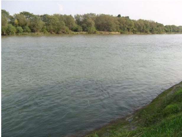
The Igirishu Kaigan on the Kitakami River in September

The city of Hanamaki has finally recognized the importance of this stretch of river and beautified it with walkways, lookouts and a host of flowers, many of which appear in Kenji's works. On this particular Sunday the 21st, a light rain was falling. I walked along the river, on the narrow path that cuts through the cosmos and sunflowers—I even wrote a poem about the path called "Light Years"—and truly felt that this was the place Kenji called "the shores of Shura." (Shura is one of the realms of existence, the one just below "Humans," where pandemonium reigns...a kind of Buddhist Purgatory.)