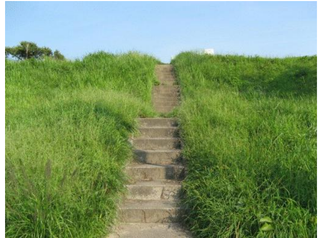
Stone steps leading to Igirisu Kaigan

I spent that morning walking the shores of the English Coast. This is, of course, that part of the bank of the Kitakami River that Kenji renamed “Igirisu Kaigan.”