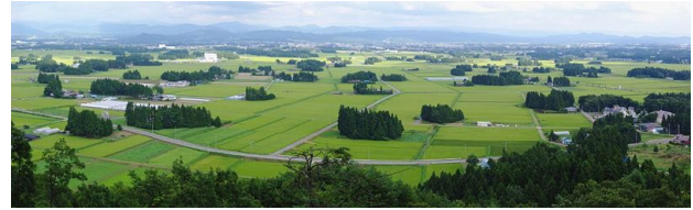
Hanamaki from Enmanji-Kanon