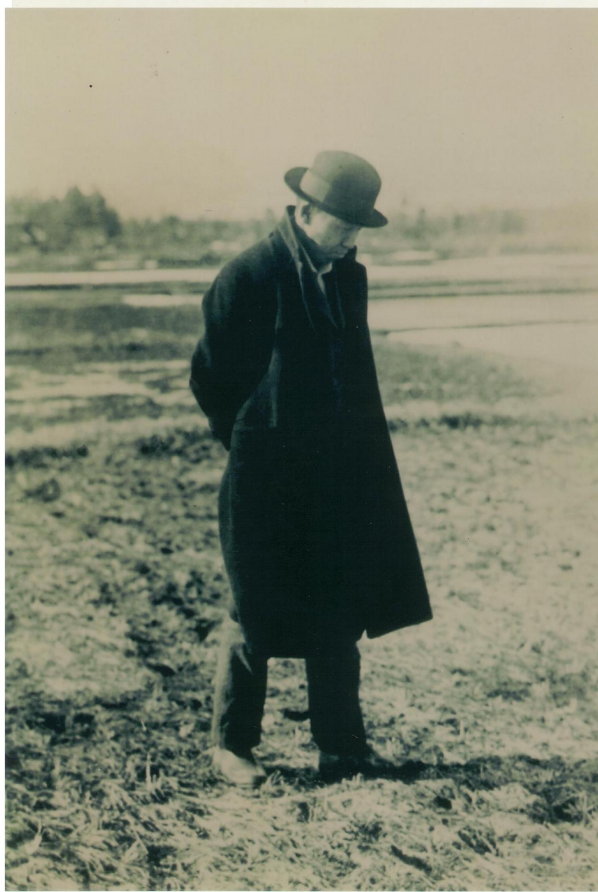
Astride the years: Kenji Miyazawa, who speaks to us now as if he were among us still.

This mixture of a deep religious faith and an unstinting scientific methodology applied to all observation is unique in Japanese literature. The two — faith and science — come together in ways the three Semitic religions — Judaism, Christianity and Islam — find hard to reconcile.