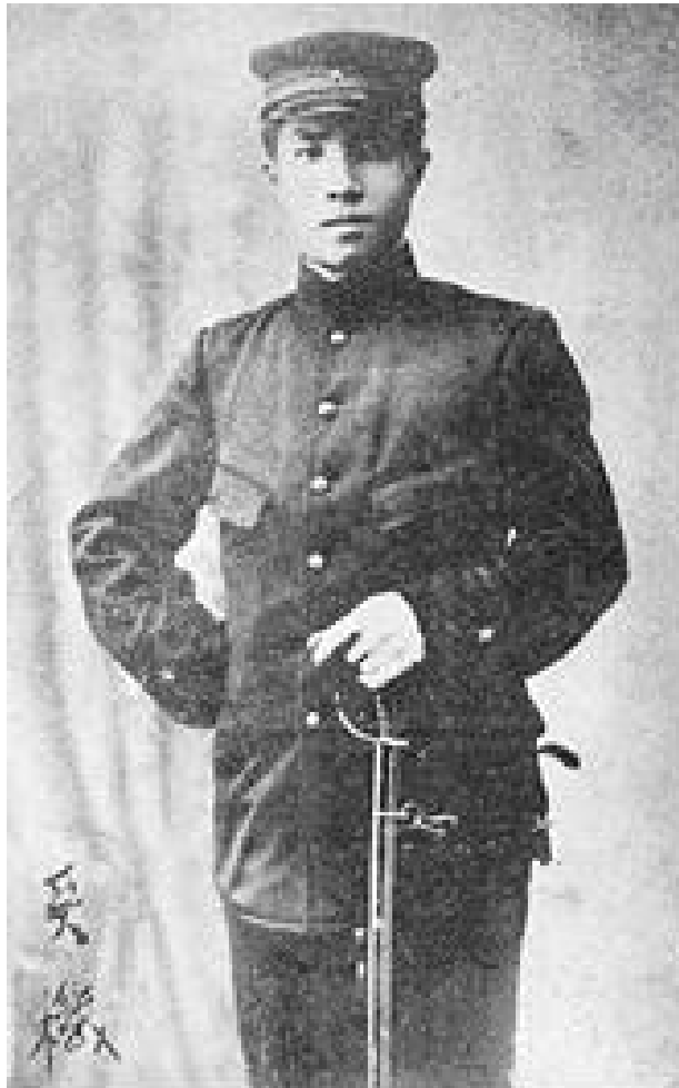
Tojo Hideki as a young army officer

Issued in January 1941 in the name of Tojo Hideki, then minister of the army, the Senjinkun is known today virtually for that command alone. Because of that, I was doubly surprised when I read the code, along with an account of how it came into being. First, I learned that the Japanese army prepared it in an attempt to counter the widespread collapse of military discipline on the Chinese front: “violence against superior officers, desertions, rape, arson, pillage” – the kind of criminal acts “not seen on the battlefields during the Sino-Japanese and Russo-Japanese Wars,” wrote Shirane Takayuki, one of the small group of officers tasked to write it.[12] Shirane was no more than a cavalry lieutenant in the spring of 1939 when he was pulled from the unit confronting Chiang Kai-shek’s army to work on