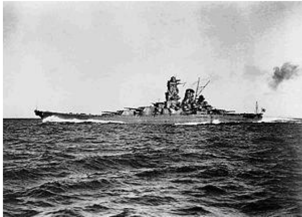
Battleship Yamato running trials

The result: six of the ten warships that made up the fleet were sunk, including the flagship Yamato, with 3,700 men lost.