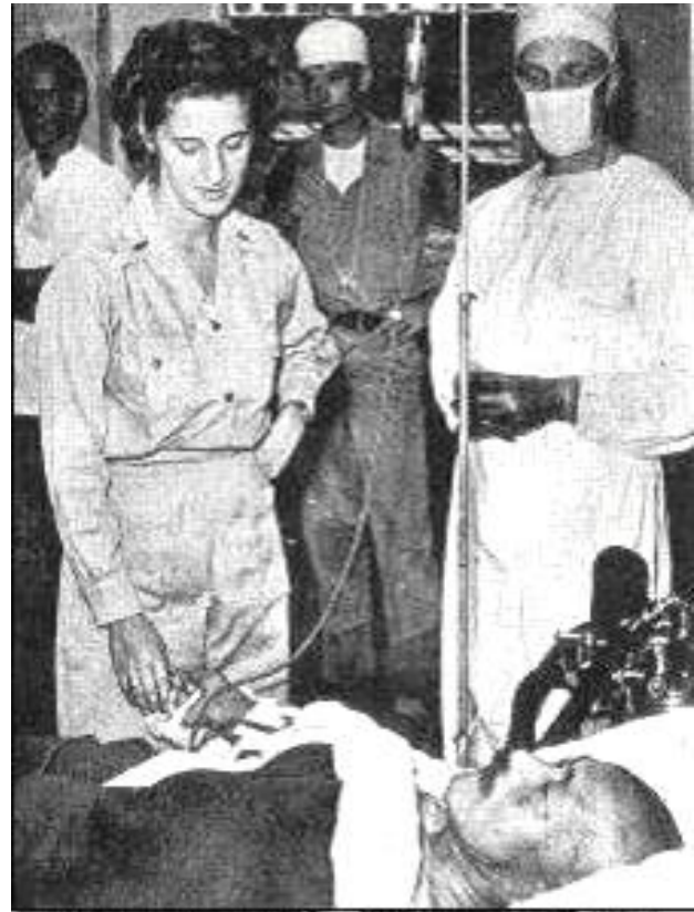
Tojo Hideki rescued after suicide attempt