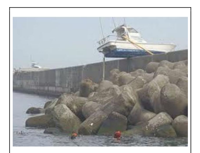
In Tohoku, seawalls and tetrapods were overwhelmed

does offer some lessons, positive and negative, to those in a position to decide, and some hints to observers of what we should watch for. The two disasters are not completely different, as some might assume because they see the Higashi Nihon daishinsai as a "natural disaster" and Minamata as manmade. Rather it is the mutual influences of human beings and nature on each other that make natural disasters.