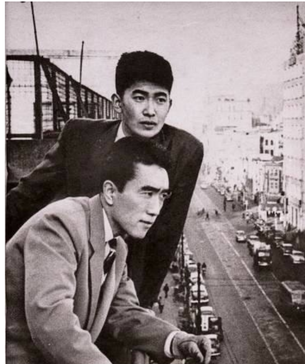
Ishihara Shintaro in 1956 with fellow novelist Mishima Yukio (foreground)