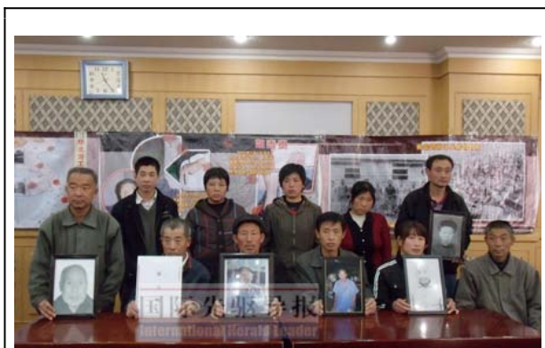
The five plaintiffs in the Shinanogawa lawsuit against Nishimatsu, along with heirs of two other victims, announce their opposition to the compensation pact at a Beijing press conference on April 27.

The truth is that all the plaintiffs of the Nishimatsu-Shinanogawa forced labor lawsuit in Japan, who were confirmed by both Nishimatsu and the plaintiffs' Japanese attorneys in June 2009 as the representatives to negotiate with the company, did not sign any settlement agreement with Nishimatsu. The root cause for this are: (a) Nishimatsu insisted to state in the content of the Nishimatsu-Shinanogawa Settlement Agreement [2] that "Chinese people's right to claim had been waived", but did not allow the plaintiffs to express side by side in the Settlement Agreement that they could not accept this wrong viewpoint; (b) In order to make clear its unyielding position of not taking any legal liability, Nishimatsu deliberately uses the term "atonement money (償い金)" to ambiguously name the damages that they should have paid to the Chinese victims; and (c) Moreover, Nishimatsu unreasonably requires those who accept the "settlement" to bear hereafter the obligation of ensuring that the corporation will be immune from any future liability from any other parties for this case. This article discusses these and other shortcomings of the unacceptable "settlement" in detail.