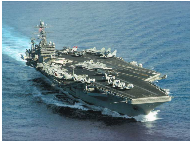
US Aircraft Carrier in the Persian Gulf

. . . demonstrates that military 'security' alone is never enough. It may, over the shorter term, deter or defeat rival states....[b]ut if, by such victories, the nation over-extends itself geographically and strategically; if, even at a less imperial level, it chooses to devote a large proportion of its total income to 'protection,' leaving less for 'productive investment,' it is likely to find its economic output slowing down, with dire implications for its long-term capacity to maintain both its citizens' consumption demands and its international position (Kennedy 1987:539).[5]