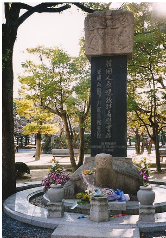
Memorial for the Korean victims of atomic bombing in Hiroshima