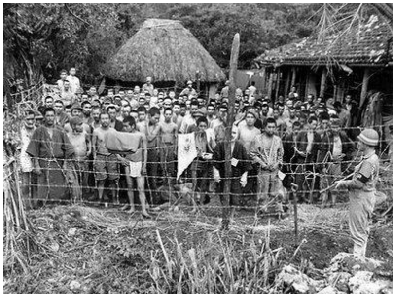
A Marine guards Japanese prisoners of war after the Battle of Okinawa. More than 148,000 civilians died in the campaign.

The extreme fear of “brute Americans and British” [cultivated by the Japanese military] was a factor that made people choose death. Japanese military experiences of slaughter of Chinese people on the continent since the “Manchurian Incident” was widely discussed; and about the fate of residents at large at the time when the war turned out to be a “losing battle”, people despaired anticipating plunder, violence, slaughter by the American military. There were returned migrants who thought “the American military can no way be expected to kill residents”, but returnees were regarded as suspected spies and hence were unable to speak positively. To make such a statement was to court denunciation as a spy and slaughtered.