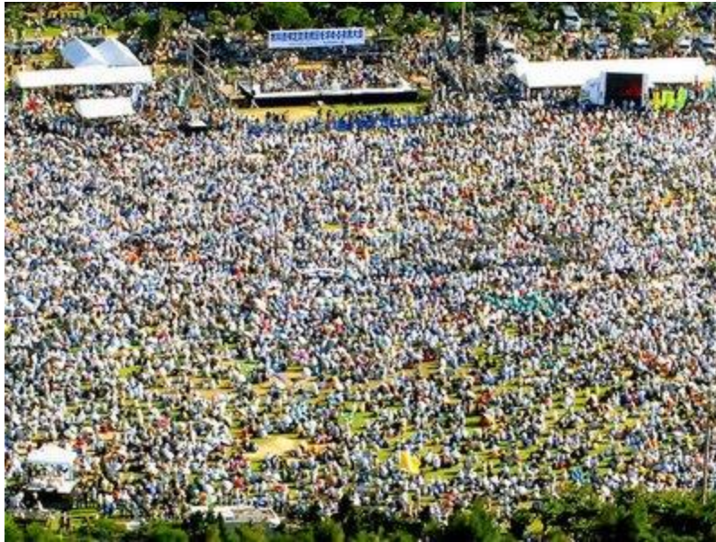
Thousands of protesters in Ginowan, Okinawa, demanded that Japanese government drop plans to remove references in textbooks to the coerced mass suicides on their island in 1945.

Certainly, the Okinawans' consensus moved the Textbook Approval Council, resulting in a degree of restoration of the wording. It is not at all the case that Okinawan efforts were for naught.