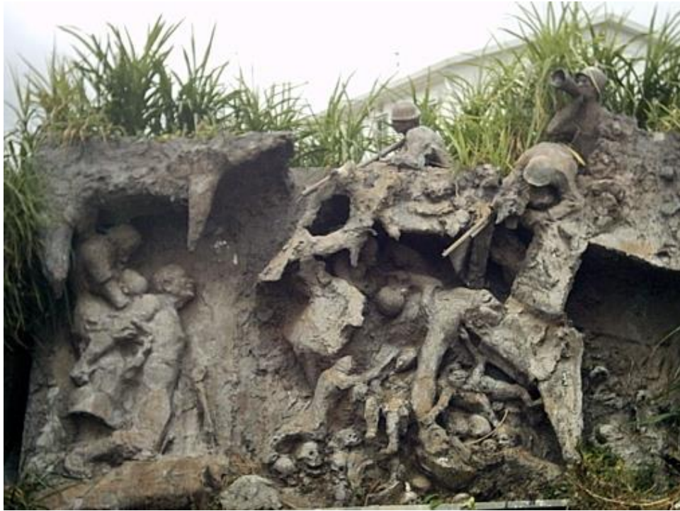
Okinawan sculptor Kinjo Minoru's relief depicting the horror of the Battle of Okinawa, during which many Okinawans were killed or forced to commit suicide after seeking refuge in the island's caves.