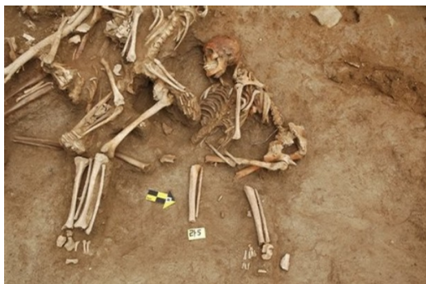
The remains of 110 victims of the mass executions of political prisoners in 1950 in Cheongwon, Chungbuk, south of Seoul. August 2007 photo, TRC

The third category includes killings conducted during ROK counterinsurgency operations against communist guerillas. The victims primarily resided near areas with active guerillas in the Southern Mountains. Witnesses residing in the targeted areas described the tactics used as brutal. The ROK employed a three-all policy (kill-all, burn-all, loot-all), which was a scorched earth policy used by Japanese Imperial forces while suppressing anti-Japanese forces in China.