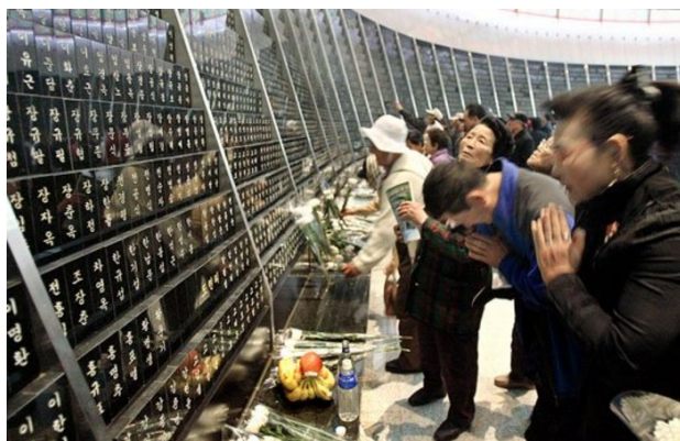
Prayers at the wall inscribing the names of the estimated 30,000 Jeju victims in the Jeju Peace Memorial Park

The Jeju April 3 incident of 1948 occurred shortly before the first general election, and was unique in the number of victims, and the lasting effect on the Jeju Island. [6] Embedded in a strong collective regional identity, the Jeju people's tragedy became a popular theme for novels and poems. While the victims' families fought alone to settle the Guchang incident, the Jeju Incident succeeded in drawing the active support of intellectuals and activists and received wide local media attention. Its historical importance in the road to the establishment of the divided governments in the Korean peninsula and the strong sense of collective victimization of Jeju people contributed to making it a national agenda after democratization. The transformation of the political and ideological landscape conditioned by democratization, along with supporters petitioning for reconciliation, emboldened the surviving families to divulge their stories. Scholars and journalists have confirmed that most of the victims of the Incident were innocent civilians, whose stories are now told in the April 3 Peace Park and Memorial Museum which opened in 2008.