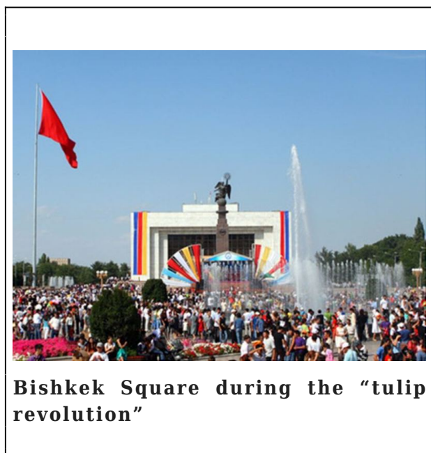
Bishkek Square during the "tulip revolution"