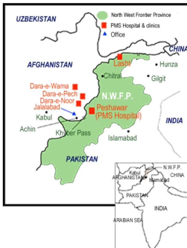
Map showing Peshawar-kai projects in Afghanistan

This year has seen a general deterioration of security in Afghanistan. The Agency Coordinating Body for Afghan Relief, which coordinates NGO groups working in Afghanistan, reports that nineteen NGO workers were killed by Taliban militia forces and bandits between January and July, surpassing the total death toll in 2007.