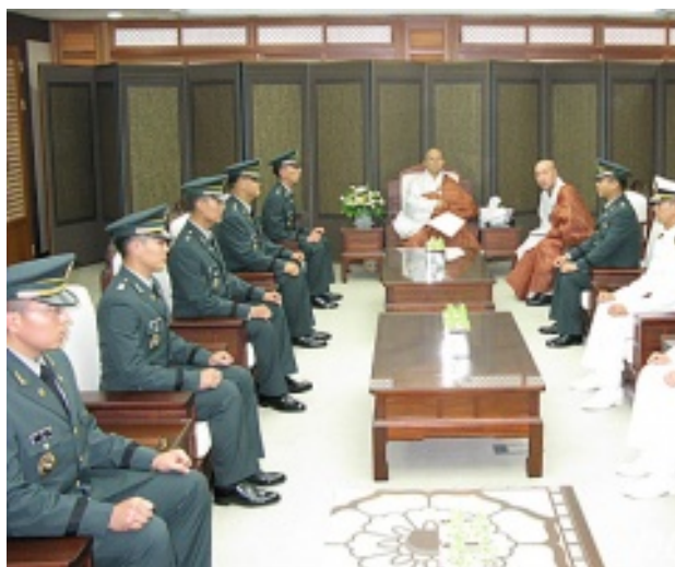
Buddhist chaplains (kunsŭng) in the Korean Army, wearing military uniforms, symbolize the collusive ties between institutional Buddhism and the military