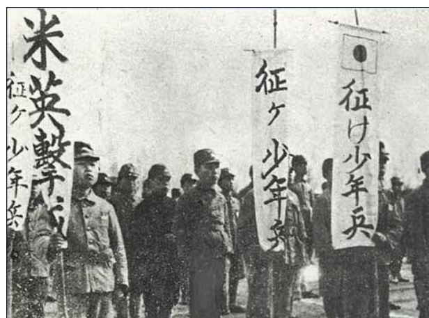
Korean youths conscripted by the Japanese authorities in the last years of the Pacific War

Conscription, first applied to Korean subjects of the Japanese Empire by Japanese colonial authorities in 1943 (promulgated March 1, effective August 1), was reintroduced soon after the establishment of the post-colonial Korean state on August 15, 1948. The first Military Duty Law ( pyōngyōkpōp ), promulgated on August 6, 1949, drew largely on colonial precedents and continental European (German and French) models, putting all male citizens under the age of 40 under service obligations, requiring those whose obligations were unfulfilled to return from sojourns abroad before reaching the age of 26 (and prohibiting anybody above this age from traveling abroad until fulfillment of the service obligations). Exceptions were only made for those declared medically unfit, criminals, or delinquents. 26 In anticipation of the coming all-out conflict with the competing regime in the Northern part of the peninsula and wishing to “consolidate” the militaristic nationalist platform and crush discontent among citizens at official corruption and the dire socio-economic situation, the Syngman Rhee regime began from an early point to militarize the schools as well: on December 26, 1948, regular military exercises were introduced in all schools above the middle level. 27 In the beginning of the Korean War, on