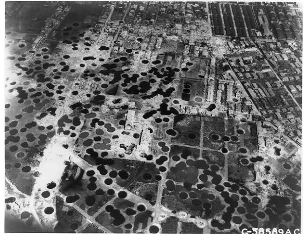
Osaka damage from bombing raids

were killed, 340,000 houses were destroyed, and an estimated 1.2 million people lost their homes and were driven from the city.