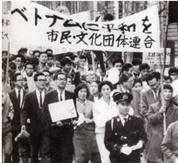
Beheiren Anti-Vietnam War demonstration of April 24, 1965 shows the formality of the Beheiren style in the glare of the hoped for international media

In particular, he promoted the idea that the Japanese people should avoid becoming “war perpetrators,” by refusing to collaborate with the United States in bombing and killing Vietnamese. He pointed out that Japanese media had paid ample attention to the victimization of Japanese by firebombs and atomic bombs, but little to the role Japanese played as assailants during the Asia Pacific War and subsequent Asian wars. To grasp the possibility of Japanese becoming assailants in the Vietnam War, he stressed the necessity of clearly recognizing the historical fact that the Japanese people had been both victims and assailants in the Asia-Pacific War. It was a powerful appeal at a time when not only the general population but also many intellectuals were preoccupied with only one side of their war experiences - as victims both of the Japanese military and of U.S. bombing.