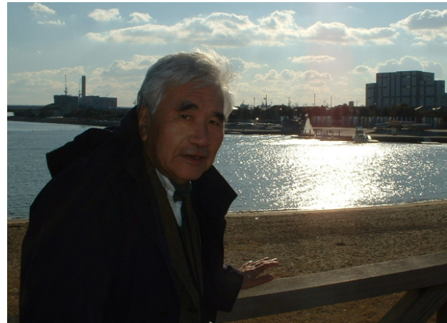
Oda in Ohama

Reconciliation in its true sense between the victims and assailants of war can only be reached when assailants accept responsibility for crimes they committed and offer sincere apologies and compensation to their victims, and in return when the victims tolerantly accept those apologies. To accomplish this, it is vital that assailants use their moral imagination in order to re-experience the psychological pain of the victims, and to internalize such pain as their own. As Oda clearly explained, by using the fraudulent thinking of the words on the cenotaph in the Hiroshima Peace Park ("Please sleep peacefully, as (we) will not repeat the mistake"), we cannot establish a humane, peaceful and culturally enriched inter-relationship between Japan and the United States based upon true reconciliation. The same can be said regarding Japan's relationship with nations of the Asia Pacific region that were victimized by Japanese colonialism or wartime military campaigns and atrocities.