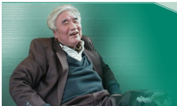
Oda Makoto at 75

On 30 July, 2007, social and political critic, novelist and political activist Oda Makoto died in Japan at the age of 75. Throughout his life, he published numerous essays and more than 100 books including some thirty novels. Two of his novels, Hiroshima and Gyokusai (The Breaking Jewel), have been translated into English and dramatized for a BBC radio program and broadcast worldwide. In Japan, however, he is remembered above all as the political activist who founded and led Beheiren (Japan Peace-for-Vietnam Citizen's Alliance), a major grassroots movement against the Vietnam War, which gained extraordinary popular support in the 1960s and 1970s.