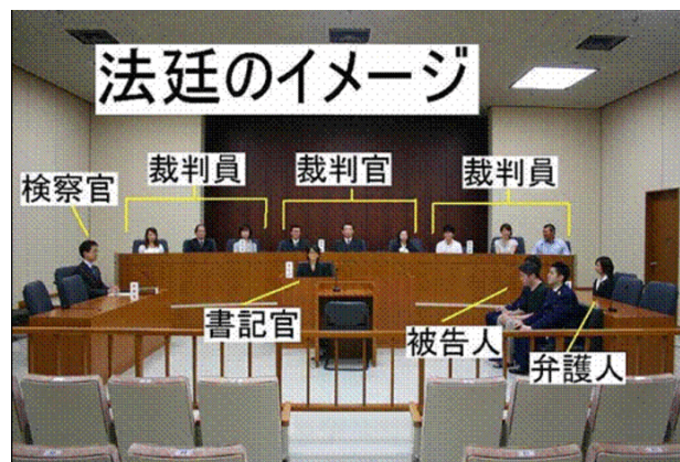
Simulated courtroom scene showing lay advocates ??? judges ??? defendant ??? prosecutor ??? defense counsel ??? and court stenographer ???

the judicial system and . . . their confidence in it." [6] The Act aims to achieve this objective via the appointment of lay assessors to serve alongside professional judges in designated cases. It does not affect pre-existing rules and conventions concerning public access to court hearings or court files such as restrictions imposed on reporters through courthouse "press clubs" or other issues related to public understanding of trials and the legal system. Regarding the role to be played by lay assessors, despite the declared mission of promoting public understanding, the Act strictly prohibits assessors from disclosing any information from or pertaining to the panel's deliberations.