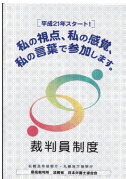
"The Lay Assessor System: Participating with My Opinions, My Sentiments, and My Words" -- cover of undated Supreme Court pamphlet for public distribution, 2006.

On May 21, 2009, lay citizens will join professional judges in deciding the fate of suspects of major crimes in Japan's new saiban-