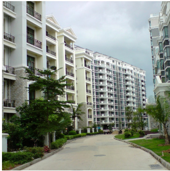
Contemporary gated community

despite state admonitions to cultivate public virtue, encourages a hedonistic carelessness about the rest of society. Cultivation has become self measured against an advertised and propagandised progressive, modern civilisation of material well being. It is cultivated in the form of rising in consumer status, in particular of private housing in guarded estates of various qualities.