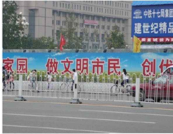
Citizens admonished to cultivate civilisation

gentry. National government would then have to be a public administration of the central state responsive to such local assemblies (Hamilton & Wang (1992), pp 144-5). Fei's reforming text is peppered with Confucian aphorisms that were addressed to junzi (the literati of pre-imperial and imperial China).