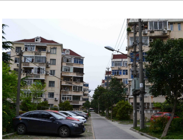
A Shanghai community.