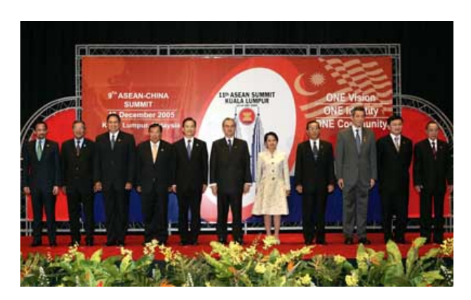
Leaders at the China-ASEAN Summit, Kuala Lumpur, Dec 5,2005

The Sino-Japanese tug-of-war over greater influence in Southeast Asia has also opened a new front - the Mekong River basin. Moves by Japan and China to help the development of the Mekong River basin have intensified in recent years.