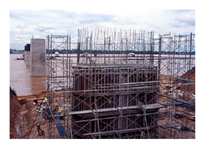
Second Mekong Friendship Bridge in construction

southern Laos, Mukdahan in northeastern Thailand and then Mawlamyine in southern Myanmar. This project was almost completed at the end of last year.