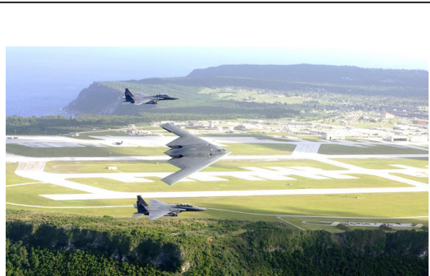
Andersen Air Force Base