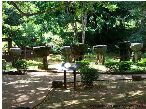
Latte stones, the foundations of Chamorro homes from 500 A.D.

For 250 years, Spanish galleons plied between Asia, Europe and the Americas, carrying silks, spices, porcelain, cotton, and ivory from Manila to Acapulco, the viceroyalty of New Spain (Mexico). These goods were then transported overland to Vera Cruz and loaded onto ships for Spain. On the return journey, cargo included Mexican silver, Spanish administrators, missionaries, and provisions for the garrison in the Marianas. En route from Acapulco, the vessels replenished supplies of food and water on Rota and Guam. 6