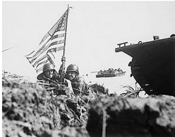
Planting the US flag on Guam

The bombing, followed by fierce combat, ravaged the island, and the main city of Hagatna was virtually destroyed. As soon as the U.S. military secured Guam, they turned the island into a strategic forward base for the final push toward Japan. As was occurring in Okinawa at approximately the same time, thousands of acres were taken for the construction of naval and air force facilities and many Chamorros were dispossessed of their ancestral clan lands (such as the village of Sumay) and moved to neighboring locations designated by the U.S. military.