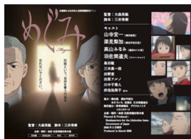
Poster of the animation film 'Megumi', released by the Japanese government internet television in March 2008 and available for free rental in video

The prime ministers who ruled Japan since the initiation of the Six-Party Talks in 2003 have taken very distinct policies with regard to North Korea. [22] Unsurprisingly, changes in bilateral policy did not fail to leave their impact in the multilateral setting. Prime Minister Koizumi Junichiro revamped bilateral talks in 2000 through the resumption of formal normalization talks, which had been stalled since 1992. He left an important legacy with the first bilateral summits in history, in September 2002 and May 2004. This engaging approach went against the course of President Bush, who early in 2002 famously included North Korea in an 'Axis of Evil.' During the first summit Koizumi and North Korean leader Kim Jong-il adopted the Pyongyang Declaration, which formally stated that both sides would 'make every possible effort' for an early normalization of relations. [23] The Japanese government moved away from Koizumi's conciliatory approach, however, when it stalled official talks in 2002 due to its dissatisfaction with Pyongyang's handling of the abduction issue. [24]