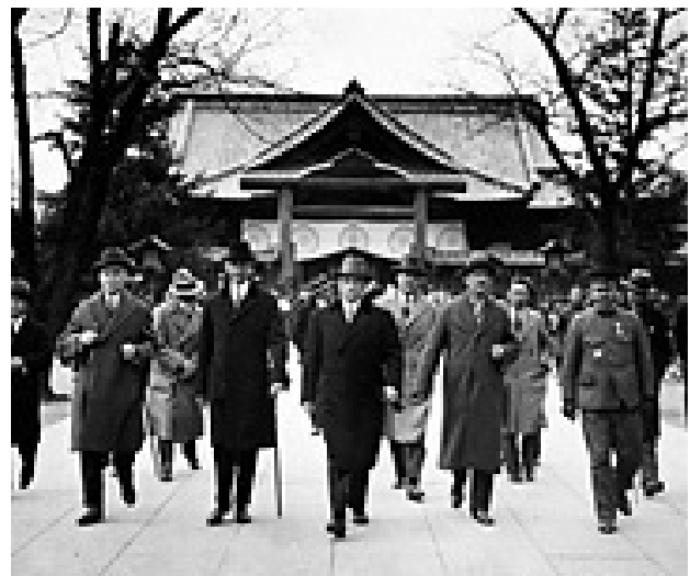
March 1932, Lytton Commission at Yasukuni Shrine. Lytton is second left

Commission to China in the first place? At the time of the Manchurian Incident, the top priority of Chiang Kai-shek's nationalist government, whose capital was Nanking (now called Nanjing), was to eliminate the Communist Party as the "arch enemy" at home, rather than stand up to the invading Japanese army. Chiang immediately appealed to the League of Nations to deal with the Japanese invasion, thereby putting the problem in the international arena.