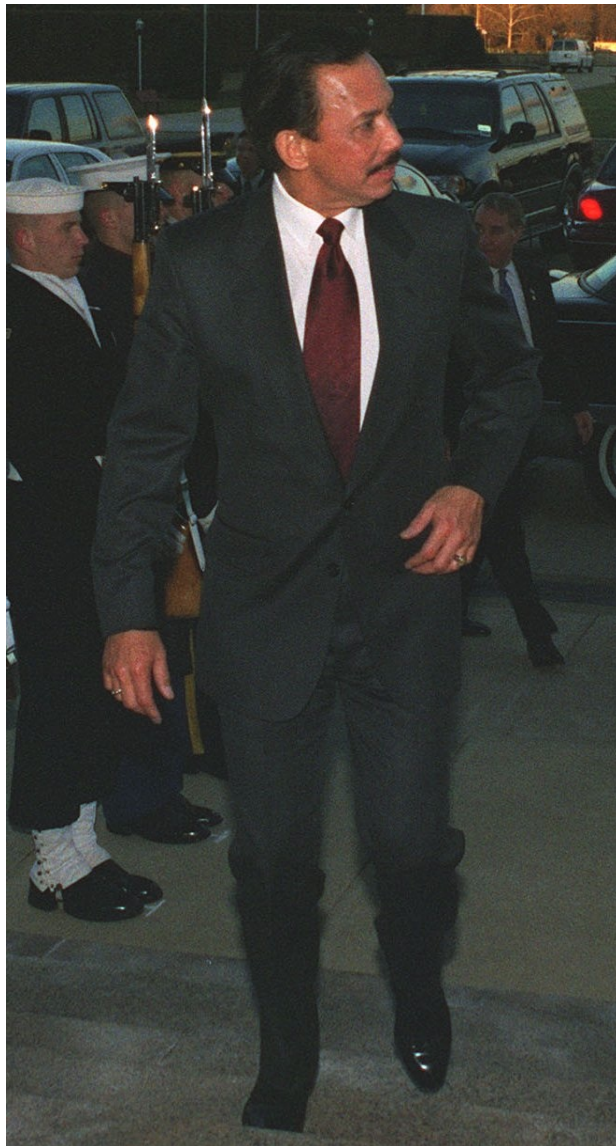
Sultan Hassanal Bolkiah

whether from domestic (dynastic) or external shocks.