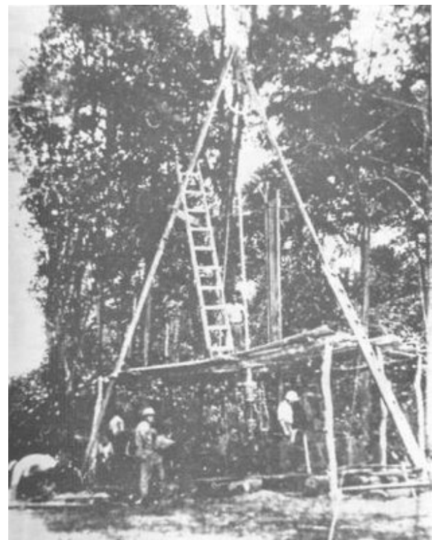
Shell drilling rig in Brunei, 1926

The Shell group of companies, which, from 1913, pioneered the search for oil in Brunei and, from 1929, commenced the exploitation of Brunei's hydrocarbon resources, made Brunei, upon its full independence in 1984, one of the richest states in the world. Notably, however, Brunei is not a member of the Organization of Petroleum Exporting Countries (OPEC), and, as a relatively small producer country, is not officially constrained by OPEC production quotas.