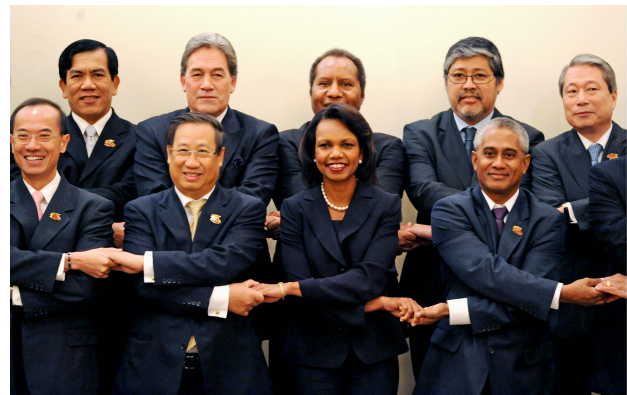
ASEAN Regional Forum leaders meet in 2008

While there is great scepticism about the capacity of both the ASEAN, and the security organisation it spawned – the ASEAN Regional Forum (ARF) – to manage effectively a number of pressing issues, [46] a focus on substantive 'outcomes' may miss more subtle processes of socialisation and identification that are steadily transforming perceptions within, and of, the region. Although ASEAN may have originally emerged as a defensive response to the actions of extra-regional powers during the Cold War, its very endurance has given political expression and an increasing sense of identity to what was hitherto a rather arbitrary geographical space. It is also worth noting that there has been no direct conflict between ASEAN members since its inception – an achievement for which ASEAN can take some credit. [47]