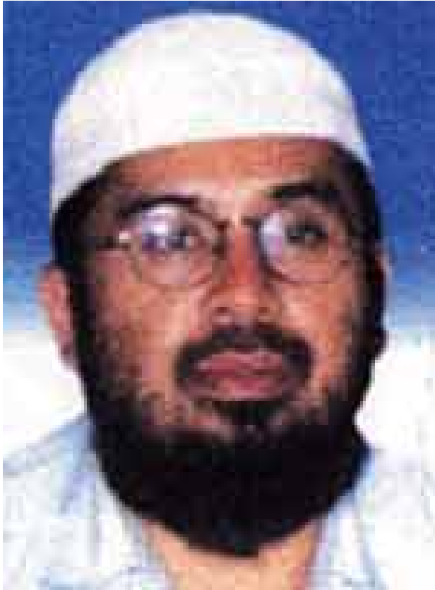
Head of Jamaah Islamiyah

After the overthrow of the Soekarno regime, the fortunes of Darul Islam turned. Virulently opposed to 'the godless' Communists, DI veterans played a strong role in the fight against communism, from the mid-1960s through the 1980s. All Islamic organisations, including DI, enthusiastically backed the CIA-orchestrated coup (from 1965 to 1966) that installed the Soeharto dictatorship and resulted in the massacre of an estimated 500,000 Communist Party members, workers, and sympathisers. When the Soviet Union invaded Afghanistan in 1980, Darul Islam sent 360 [4] members to help the Afghan mujahideen . [5] Among jihadsts who came to Afghan in that period was Osama bin Laden and thousands of other jihadists worldwide. In Pakistan and Afghanistan DI members came into contact with Sheikh Abdullah Yussuf Azzam [6], who was the key to establishing what the International Legion of Islam is today (Bodansky, 1999: 10). Bin Laden's role was to transmit Saudi money – not just his own. By the late 1980s, there were branches and recruitment