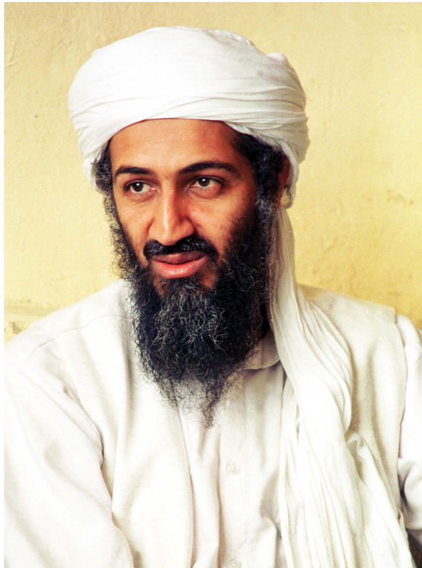
Osama bin Laden

for the evolution and organisation of political life (Lindholm, 1986: 334).