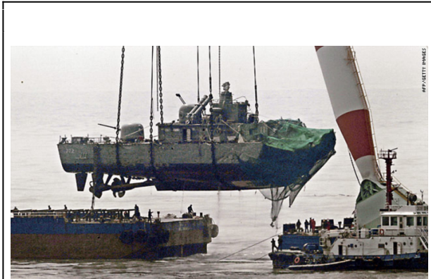
Photo: A Crane lifts the stern of the Cheonan

of the South Korean defense ministry, since the ministry controlled its release on May 20 and since then has handled official presentations.