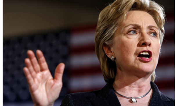
U.S. Secretary of State Hillary Clinton

Immediately after the 5-page statement's release Hillary Clinton intoned "provocative actions have consequences" and "the international community" "cannot allow [North Korea's] attack on South Korea to go unanswered."