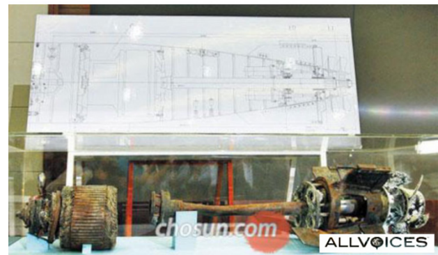
Photo: South Korea's Defense Ministry displays the motor and running gear of the torpedo alleged to have hit the Cheonan.