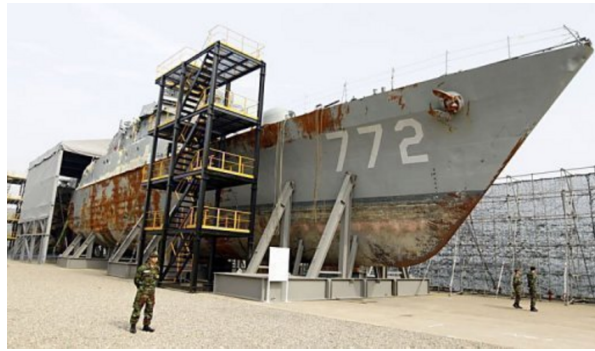
Photo: South Korean navy personnel stand guard next to the wreckage of the naval vessel Cheonan