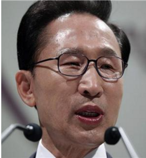
Photo: South Korean President Lee Myung-bak