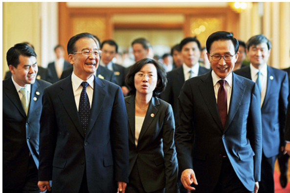
Photo: Chinese Premier Wen Jiabao, left, met with South Korean President Lee Myung-bak, right, and Japan's Prime Minister Yukio Hatoyama, unseen, on Jeju Island on May 29 & 30. At a joint press briefing Wen said: "What is most urgent for now is to reduce the tensions from the Cheonan incident and especially avoid a clash."

Premier Wen Jiabao has talked about judging the Cheonan incident in an "objective and fair manner" and based on the facts. The US and South Korea have dropped strong hints that the 5-page JIG statement is compelling and China does not need to wait. Both want China to act "responsibly."