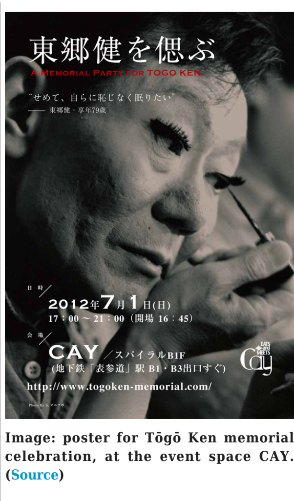
Image: poster for Tōgō Ken memorial celebration, at the event space CAY.

Tōgō was revolutionary in articulating the political nature of sex. The Japanese term for “politics” is seiji 政治, written with a combination of two different characters meaning government. Tōgō pointed out the way in which sexuality was also invested in politics and politics in sexuality by replacing the first character of seiji 性治 with the homophonous character sei 性 designating sex. As he frequently argued, the Japanese family system which requires one man and one woman to come together in a joint project to produce and manage children is considered “normal” ( seijō ) simply because this is the form of family most easy to govern within the context of capitalist society.