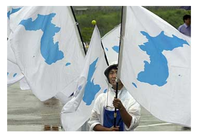
The unification flag used since 1991

During 2007 formal inter-Korean talks on a joint Olympic team took place in Kaesong in February, with more informal contacts in Kuwait in April and in Hong Kong in June 2007, but no solution was achieved. There is considerable agreement on issues such as the flag (the unification flag), the national anthem to be played when medal winners are on the podium (the 1920s version of the traditional Korean folk song 'Arirang'), and the uniforms (following earlier designs but all supplied by the South). One key area remains outstanding – and it is an issue that has remained since those early days of the 1960s – how to choose the athletes to compete.