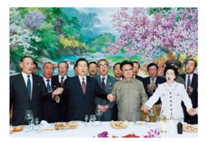
The two Kims and entourage following the June 15, 2000 Joint Declaration

The historic June 2000 summit between Kim Dae-jung and Kim Jong Il, in Pyongyang, opened the way for greater cooperation and collaboration in North-South Korean relations. Consequently, at the 2000 Sydney Olympics the two Koreas entered the Olympic stadiums under a joint flag (the so-called 'unification flag', consisting of a blue outline of the undivided Korean peninsula on a white background) and wearing identical uniforms at the opening ceremonies. It was an emotional moment for Koreans. However, the athletes competed as two separate national teams.