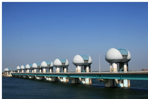
Nagara River, the last major river in Japan to be dammed - then and now. Top: As portrayed by Eisen in the 19th century. Bottom: Now - the “estuary barrage” at the mouth of the river ( Wikipedia ).

The intensive use of agricultural chemicals since the Second World War has caused contamination of soil and waterways, and has made farmland, marshland and other lowland areas uninhabitable for a number of species, causing the extinction of some, including the Japanese crested ibis ( Nipponia nippon ). 7 Fertiliser and pesticide application levels in Japan are higher than those in almost