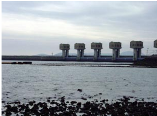
A section of the 7 km long sluice-gate across Isahaya Bay

was also an important stopover point for birds migrating between Siberia and Australasia. It made up six per cent of Japan's remaining tideland, and was habitat to about 300 species of marine life, such as the mud-skipper ( mutusugorō ), and approximately 230 different species of birds, including a population of Chinese black-headed gulls, of which only 2000 are estimated to remain worldwide (Umehara 2003).