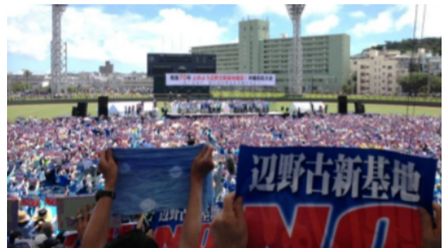
People raising cards saying "Henoko New Base: No" at the rally held at Okinawa Cellular Stadium on May 17, 2015.

Other comments indicate tour participants' solidarity with the "Okinawan struggle."