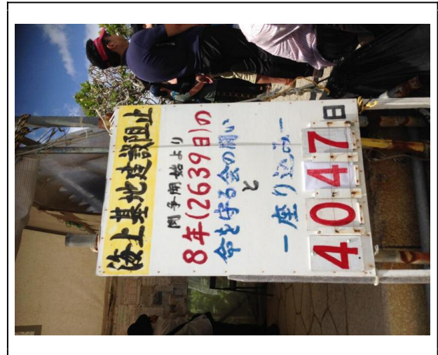
4047 days of sit-in