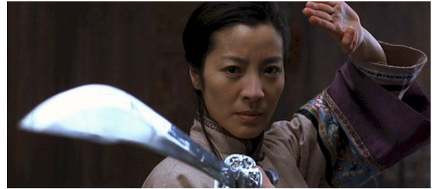
Crouching Tiger, Hidden Dragon

never was. But in fact Tan deals less in nostalgia than in juxtaposition, throwing elements from different cultures together.