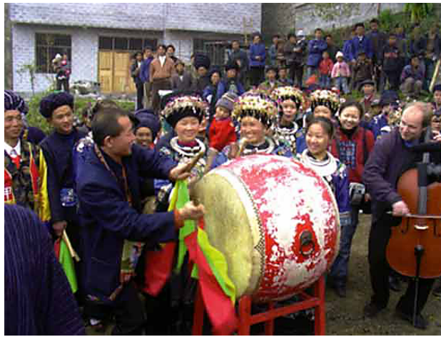
Tan Dun returns to a Miao village in Hunan for his The Map

Xiangxi, a village in rural western Hunan, where Tan once met a shaman, known as “the stone man,” who could talk to the winds and the clouds. Out of this encounter, he says, came the music, written for Yo-Yo Ma in 1999. The more-or-less Western sound of the cello is mixed with Chinese folk singing and the sounds of rushing water and clashing stones.