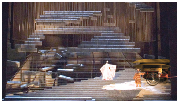
First Emperor staged at the Met

out, he was talking in Chinese on his cellphone. After he was done, he turned to me in a state of great excitement. “Just imagine,” he said, eyes shining with pleasure. “We’ve got permission to perform ‘The First Emperor’ on the Great Wall of China for the Beijing Olympics. We’ll have a worldwide audience of billions!” Since then, there have been some doubts raised about this project. In fact, the Chinese government may not let it happen after all, but the very idea of it shows the scale of Tan’s artistic ambition.