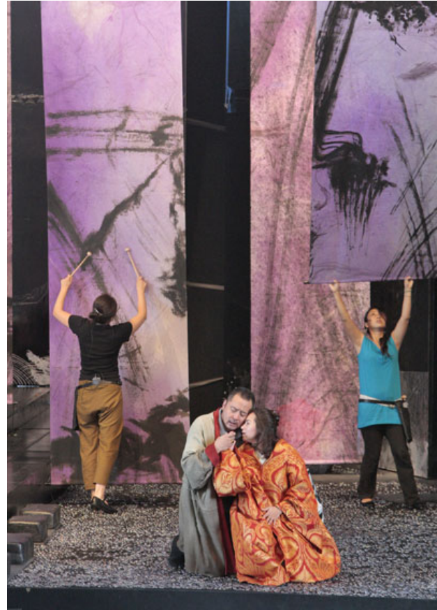
Tea performed in Santa Fe