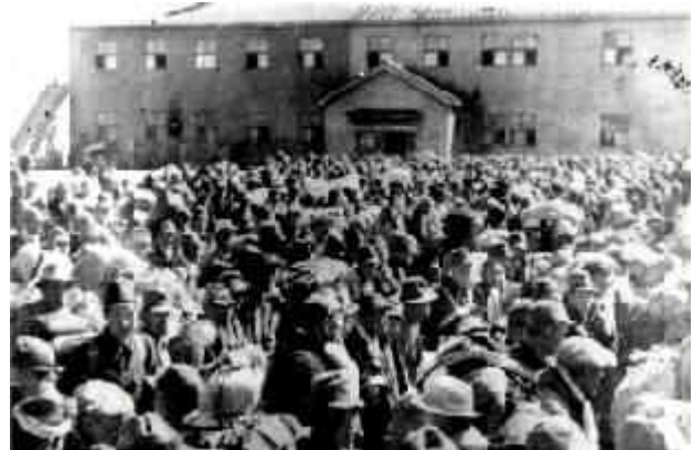
Captured Japanese in a Soviet prison camp

all of this in violation of the Potsdam Proclamation, which Japan had accepted before surrendering.[18] While Japanese acts of brutality towards Allied POWs rightly attracted outrage and punitive justice, following on from the violation of a neutrality pact and the refusal to honor a surrender, the Soviet use of Japanese POWs as slave labor in the immediate postwar era was Stalin’s third major contravention of the tenets of international law in the Far East to go unquestioned by any postwar tribunal.