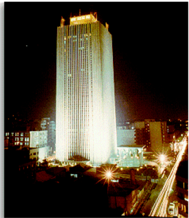
Head office - TEHRAN, IRAN

Hammering away at Iran's state-owned banks is central to US efforts to raise an international hue and cry. Through its state-owned banks, FinCEN states, "the Government of Iran disguises its involvement in proliferation and terrorism activities through an array of deceptive practices specifically designed to evade detection." By managing to get inserted the names of two state-owned banks in the most recent UN Security Council resolution on Iran, the US can now portray the cream of Iran's financial establishment (Bank Melli and Bank Saderat are Iran's two largest banks) as directly integrated into alleged regime involvement in a secret nuclear weaponization program and acts of terrorism.