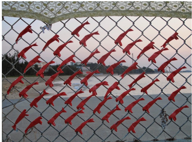
Image 6. Dugong Origami on the Fence of Camp Schwab on Jan. 1, 2014

In January 2008, the US District Court for the District of Northern California ordered the U.S. Department of