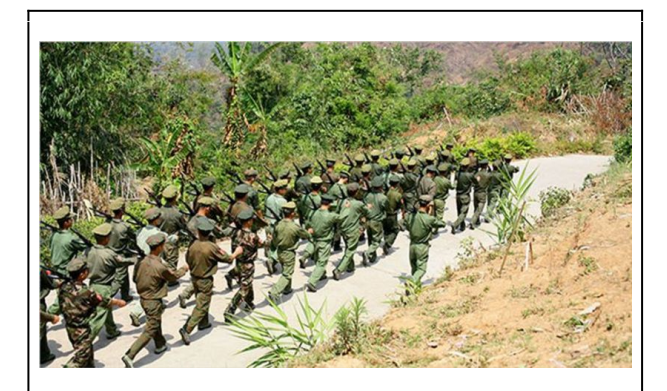
Kachin Independence Army in a 2009 photo

Suu Kyi herself is opposed to her apotheosis, but such representations promise to continue in the context of Burma's polarized political landscape. The existence of a viable "Third Force" may be a myth invented by donor agencies of Western countries and a host of mainly European private foundations eager to expand their enterprises and find a solution to Burma's decades-long political crisis. But there is a "third factor" to the equation that is bound to make Burma's journey toward democracy and peace extremely difficult: the unresolved ethnic issue. In the far north of the country, fighting flared up again last year as a ceasefire agreement between the government and one of Burma's most powerful ethnic rebel groups, the Kachin Independence Army (KIA), broke down. The KIA had made peace with the central government in 1994 ending decades of civil war. But the agreement never produced a political solution to the group's calls for autonomy and other rights.