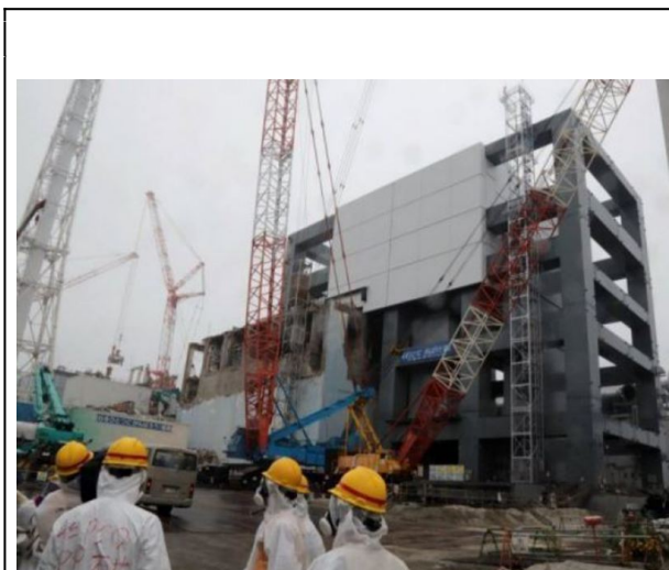
Reporters and Tokyo Electric Power Co workers during a tour of the Fukushima nuclear plant on June 12, 2013

Japan's ruined and radioactive reactor plant at Fukushima Daiichi has been an abiding source of concern among knowledgeable observers. There are a host of good reasons for this reemergence. As this Mainichi survey observes , it is now clear that several hundred tons of radiation-contaminated water is entering the ocean per day. Over the past week, it suddenly returned as an intense focus of concern in the Japanese 1 and quality overseas press. 2 There are a host of good reasons for this reemergence. As this useful summary of articles and expert statements reveals, it is now clear that several hundred tons of radiation-contaminated water is entering the ocean.