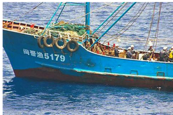
The Chinese trawler

On September 7 Japanese patrol boats intercepted a Chinese fishing trawler near Kubashima, one of the Senkaku [Chinese: Diaoyu] Islands in the East China Sea. After it repeatedly rammed the patrol boats in attempting to escape, the fishing boat was detained and its captain arrested and charged with interference in the execution of official duties. The incident would come to have enormous repercussions, shaking up Sino-Japanese relations.