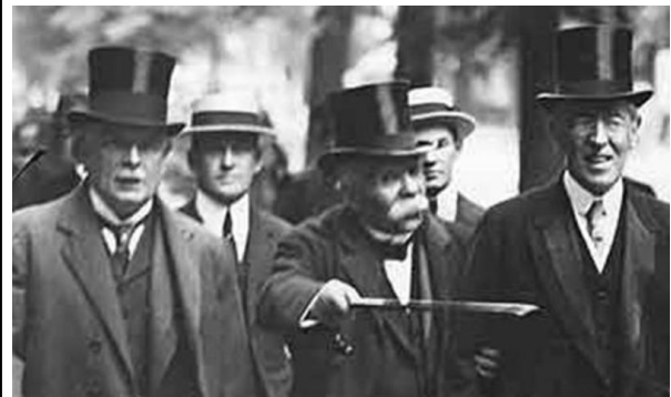
Lloyd George, Georges Clemenceau and Woodrow Wilson arriving at Versailles at the end of World War I

unintended consequence in what came after. I think the League of Nations did provide a skeletal framework for a global order in which equal sovereignty of nation-states would be the basic form but in which British hegemony would be superseded by a collective dominance of Western powers led by the economic dominance of the United States. Karl Polanyi’s The Great Transformation is an instructive lesson in the underlying changes that were taking place in the inter-war years in the global system.