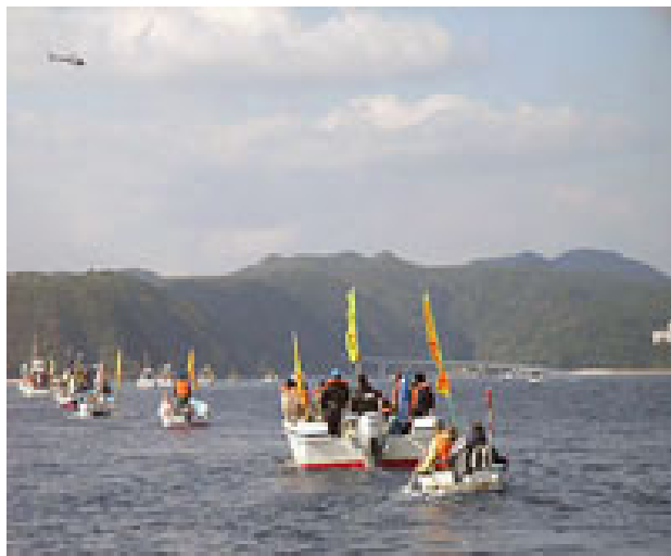
Henoko protest boats

continued without let-up for over one and a half years at the site. At a makeshift tent headquarters, Okinawan elders, some in their 80s or even 90s, mingled with fishermen and townspeople from around the island, while fishing boats, canoes, and even hardy swimmers, conducted an offshore “blockade”. All that the state’s survey team could manage to accomplish in that time was to count the dugongs (between 30 and 50) and erect four lighting beacons, which had to be dismantled with each typhoon. [4]