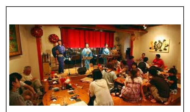
Okinawan folk music performance at Osaka restaurant

In the resulting "secondary migration" on the mainland, the largest population of Okinawans moved from Osaka to Amagasaki, just across the Kanzaki River, where their numbers increased nearly tenfold between 1935 and 1940, from 1,281 to 11,462.9 As in Osaka a decade earlier, they began organizing, at first in friendship societies of people from the same Okinawan locality. These merged in 1940 into the Amagasaki League of Okinawa Prefectural Associations, which consolidated after the war to become the present Hyogo Okinawa Association, with a membership of approximately 5,000, according to a recent survey.<sup>10</sup> During and after the war, it provided counseling free of charge to Okinawans seeking employment, negotiating with employers, applying for government permits or benefits, starting businesses, or trying to earn a living after their family breadwinner had died in the war.<sup>11</sup>