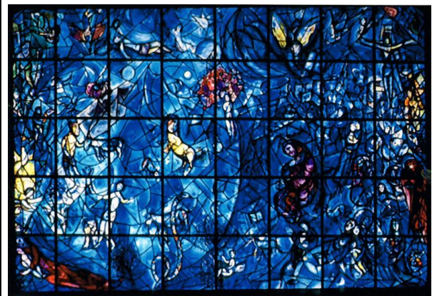
Marc Chagall, 'Peace Window', United Nations Building, New York, 1964

*This essay is an expanded version for Asia-Pacific Journal of an article published by the Oxford Research Group. The Narrative of Peace: What we can Learn from the History of Peace Thought', Oxford Research Group Newsletter, 28 Aug 2012.