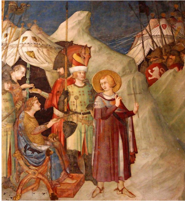
Simone Martini, St Martin Renounces his Weapons' c. 1320, Basilica di San Francesco, Assisi

The role of St Augustine (AD 354-430) has been subjected to similar distortion: in many accounts, his greatest contribution was to resolve the dilemma faced by early Christians between their temporal and spiritual obligations by formulating the doctrine of the Just War, of which he is said to be the 'father'. Yet nowhere in Augustine's abundant writings is this doctrine spelt out clearly and he would not approve of the use which has been made of his words to justify numerous wars. In his great work The City of God , Augustine was far more eloquent on the subject of peace. 'In the city of man as well as in Heaven,' he wrote, 'there is a desire for peace which may be achieved on earth to some degree. Even the warrior who had to take up arms,' said Augustine, should regard 'the prevention of shedding blood as his real mission'. Man's nature moves him powerfully 'to maintain peace with all other men as far as he is able', and anyone who can contemplate warfare without heartfelt grief has 'lost all human feeling'.